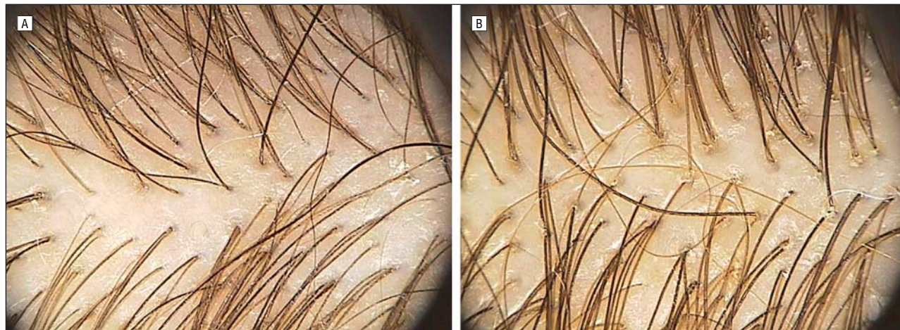
Figure 3. Improvement in the hair density score compared with baseline (A) at 12 months of oral finasteride treatment (B).

none of the patients reported adverse effects. This treatment was well accepted by the patients, who judged the results to be even better than did the investigators. The patient's opinion being generally more optimistic than that of the investigator is not surprising. In double-blind clinical trials on the efficacy of finasteride on male androgenetic alopecia, 13 patients treated with placebo reported improvement of their condition.