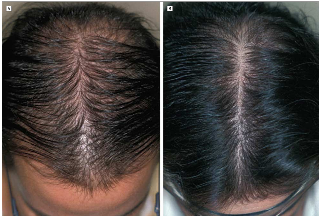
Figure 2. Ludwig pattern of hair loss shows great improvement compared with baseline (A) after 12 months of oral finasteride treatment (B).